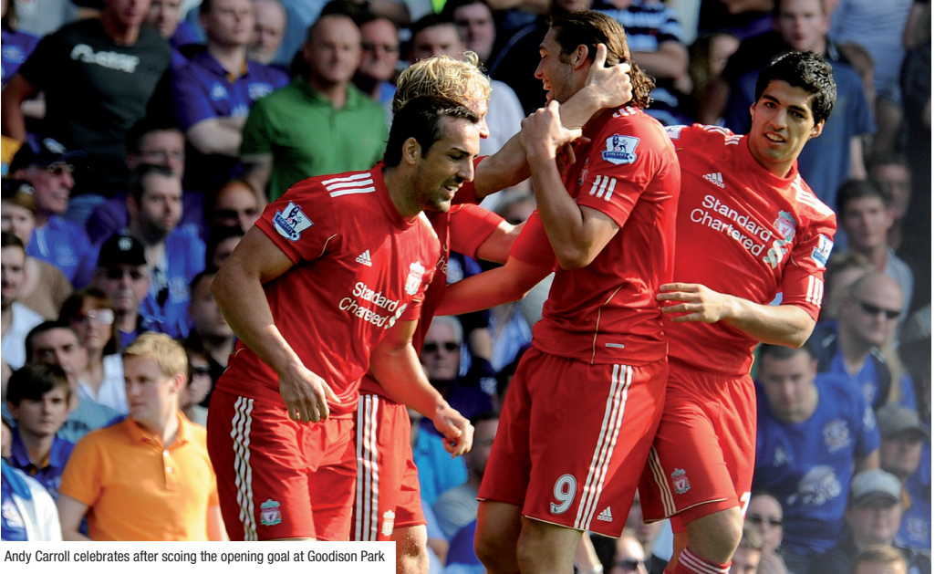
Andy Carroll celebrates after scoring the opening goal at Goodison Park