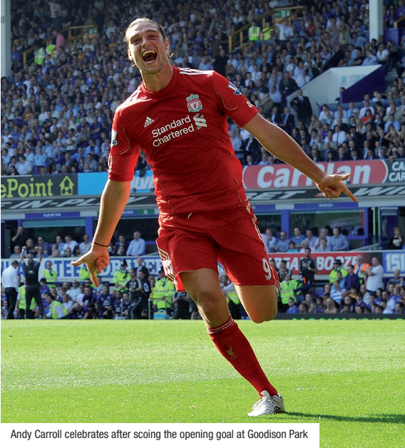
Andy Carroll celebrates after scoring the opening goal at Goodison Park